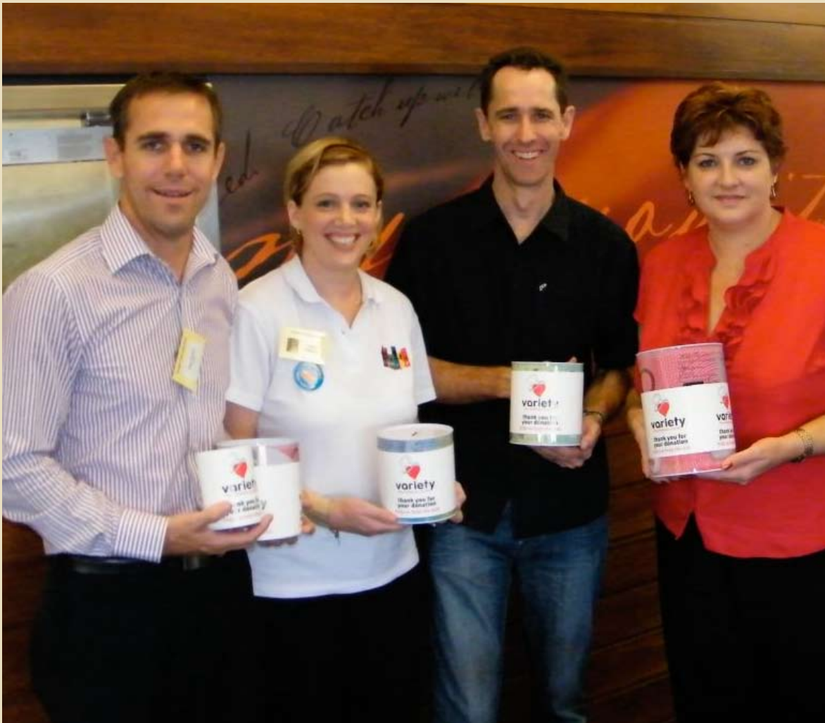
Some supporting business owners in Sandgate...